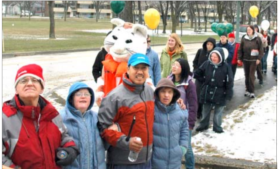
People enjoyed the 2008 Walk & festivities in spite of a surprise snowfall.

Creating a team, walking with friends, adds more fun to your day. A mini-