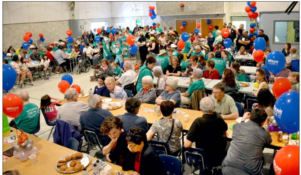
People enjoying the entertainment, food, and many prize draws after the walk.

A large number of volunteers are needed to make the walk a success.