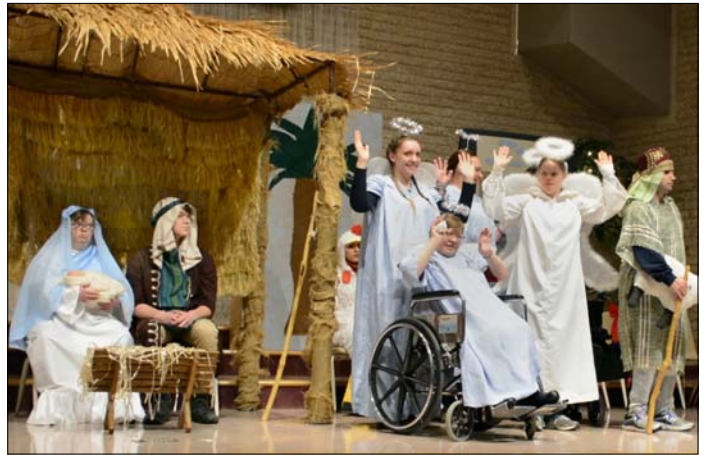
Part of the cast of the L'Arche Christmas Nativity