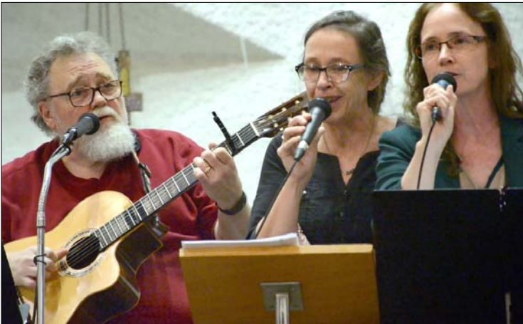
Three of the six artists at "Songs of Christmas" evening