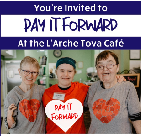
Add a donation to your bill or add a note to your online donation to continue Paying It Forward!

Thank you for your affirming words, your openness, and your generosity - we love being part of your story.