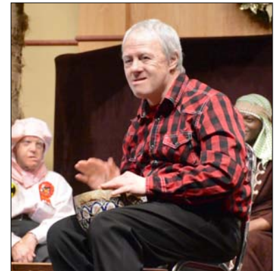
L'Arche Winnipeg members at last year's Christmas Pageant