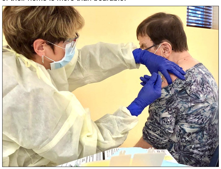
Getting the flu shot last fall

I don't know anyone who has not struggled with the isolation of dealing with Covid. For our core members who love to go out into the broader community to interact with people including other customers, cashiers, and waitresses at our L'Arche Tova Café, it has been a challenge. And yet as I see them on Zoom calls or talk to them on the phone they seem to be doing better than most of us. I think it is probably because they intuitively understand that the most important aspect of life is relationships, friendships, if you like, love. They are living with people who love them and whom they love and so life in the isolation of their home is more than bearable.