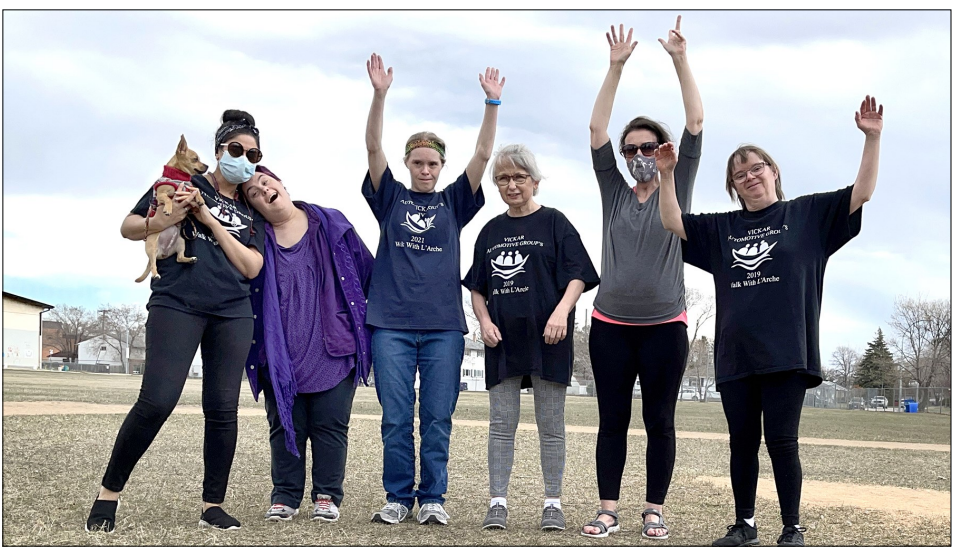
Members of Elpida house walking for L'Arche in their Windsor Park neighbourhood.