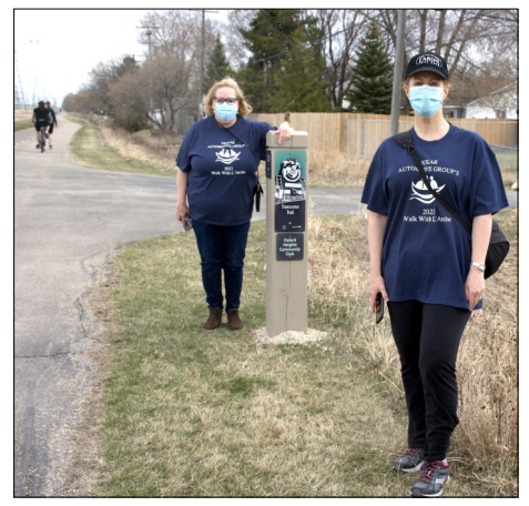
Nostalgia led some people to do last year's virtual walk on the Transcona Trail by Oxford Heights Community Club at 2 pm the time and place where hundreds usually gather for the walk & party celebration.

We appreciate your support in helping us live through these challenging times and for helping us make the 2022 Walk a successful one!