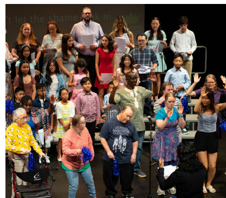
Singing & dancing at "This Is Me"

while dancing and sharing songs about belonging, friendship, and mutual support.