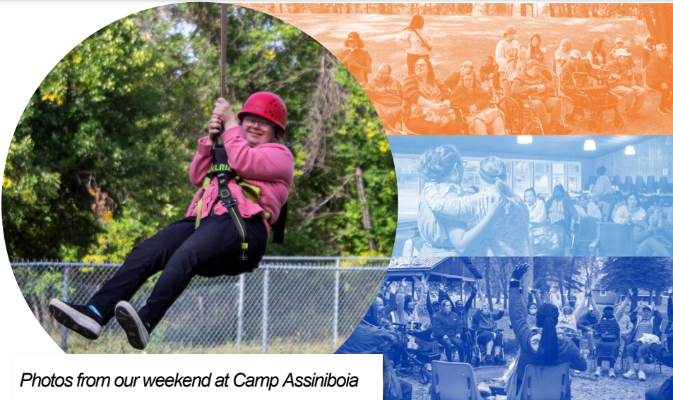
Photos from our weekend at Camp Assiniboia