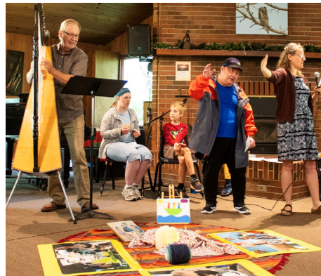
Singing at the Sunday prayer service

Follow L'Arche Winnipeg and L'Arche Tova Café on Facebook and Instagram for more!