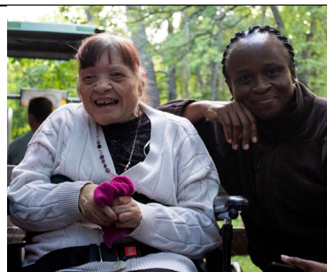
Juliette & Happiness on the wagon ride

In August we rejoiced together as one body at our solidarity music fundraiser "This Is Me," where over 200 people gathered to celebrate and support L'Arche communities around the world. Together, we raised over $4300